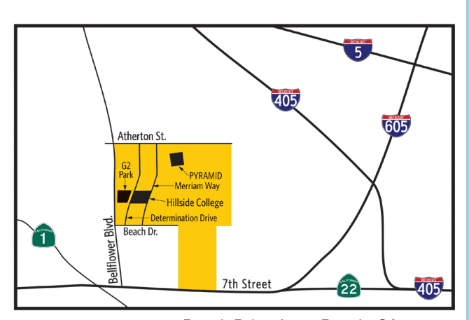
CSULB Address: 5851 Beach Drive, Long Beach, CA 90840

if you are not just being dropped off. (Look for the Parking Kiosks P on the map above). Your parents (or bus) can drop you off on Determination Drive in the turn in lane by Hillside Gateway. If you are parking, go to Lot G2. If you purchased a permit from us in advance, we will have it for you at registration. Otherwise, purchase a permit in the kiosk in Lot G2. Day permits are $15/day. Overnight permits are $30/day. If you are a resident and bringing your car, you'll need to buy a permit each day.